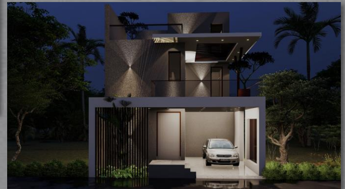
ELEVATION TYPE 'A'