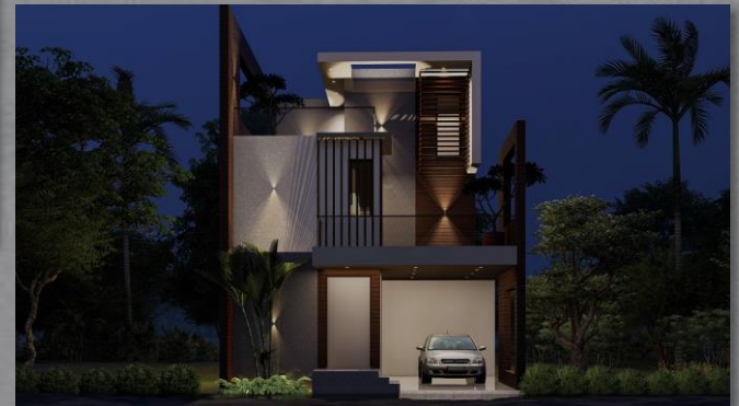
ELEVATION TYPE 'B'