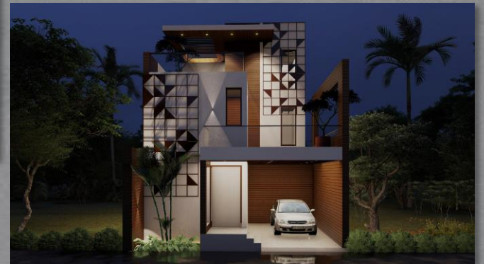
ELEVATION TYPE 'C'